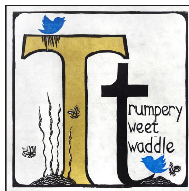
"T" is for . . . by David Witbeck, three-block linocut, image 7" x 7"