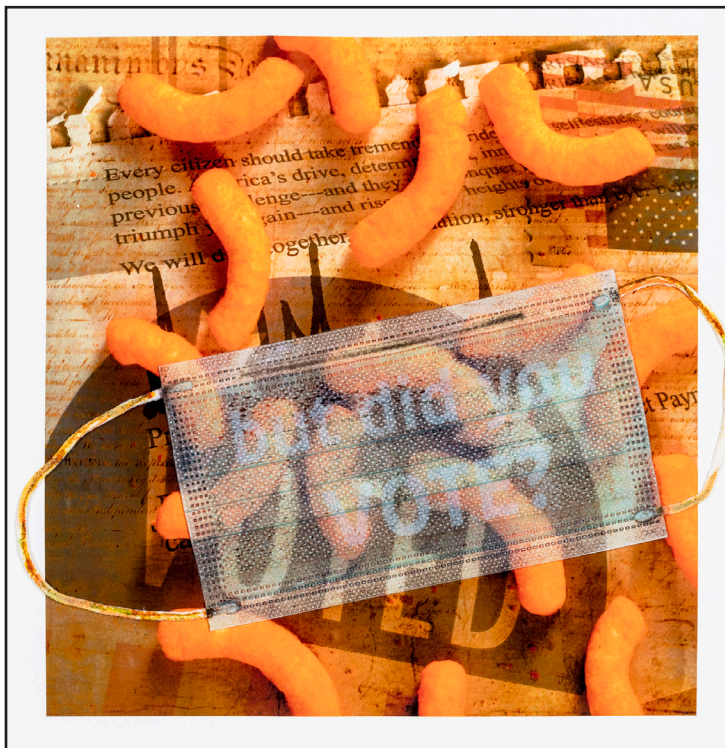
H.R. 7075 (from the Revised History of White America) by David DeMelim, Archival UltraChrome ink on 100 lb. watercolor paper with al-SHIELDS 3-ply disposable face mask (non-medical) applied chine colle, image 9.5" x 9.5"