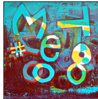
#Me Too by Angel Dean, monotype, image 11" x 11"